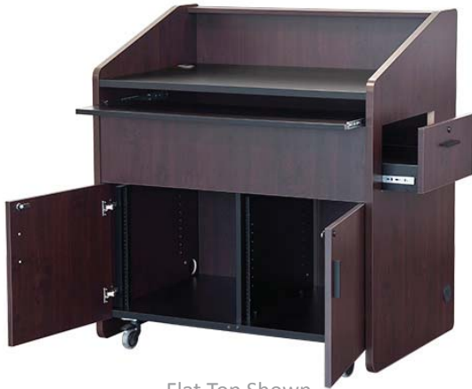
Flat Top Shown

Top rear removable, intended to easily be mounted in a wedge position or as flat large work surface, that can support monitors laptops and room control systems.