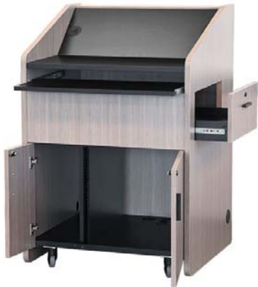
Console Top Shown

The mid sized multimedia podiums are the ideal solution for distance education, electronic classrooms and corporate training sites. Model PD3006 features a keyboard slide, a large pullout drawer with interior storage for additional electronic equipment.