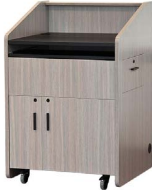
Flat Top Shown