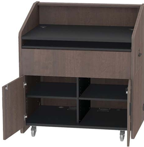
Flat Top Shown

The roll-about multimedia podiums are the ideal solution for distance education, electronic classrooms and corporate training sites. Model PD3001 features a keyboard slide, a large pullout drawer with interior storage for additional electronic equipment.