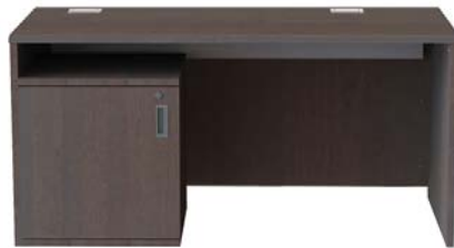
(Shown with optional PDT2224)

The multi-functional teacher/student desks are the ideal solution for classrooms. Model DSYZ6030 features a large top surface to accommodate single teacher or two students, a wire channel and grommet organize the wires on the desk. Extra charge for custom cutouts for electronics or other items specified by the customer.