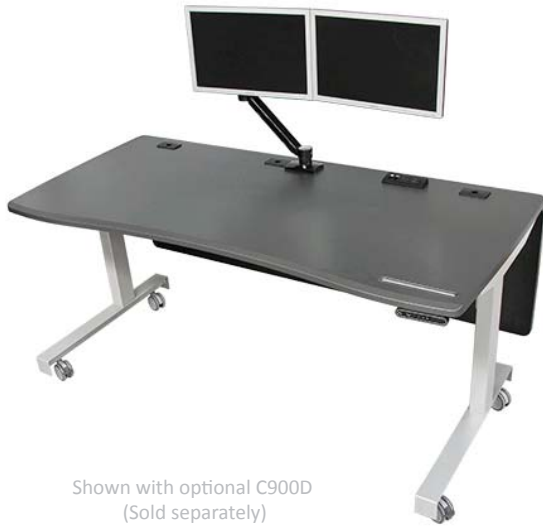
Shown with optional C900D (Sold separately)