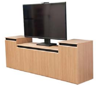
Side by side with CR3000EX (Sold separately) (70" TV shown)