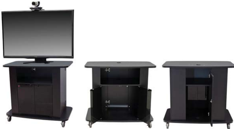
Shown with optional mount (Sold separately)